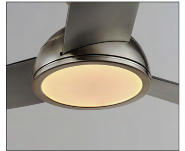
LED integrated dome