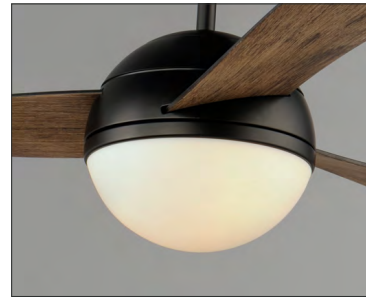
Lamp light kit with domical glass